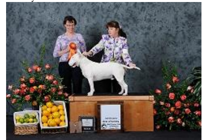
"Callahan" Glentom Sudden Impact Best Of Variety White Sweepstakes