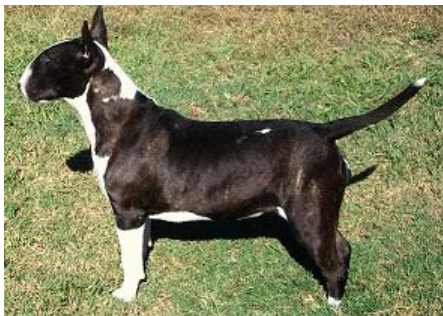
From Sire GCh. Ch. Glentom Conquistador Seeking Silver, ROM "Pippa" Glentom Rules Were Mint To Be Broken Puppy Group Second Tampa Terrier Club and her sister:

There's nothing like the thrill of watching the judge point to your baby out in the ring! Breeders and handlers work very diligently to achieve the Best in Show ribbon at every show. While that is a prestigious and honorable prize to win, let's not forget about the stepping stones along the way – there is much to be proud of from bullies of all ages and stages in their show careers! They have earned their rights to brag!